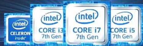
7th Generation (Kaby Lake) Support i3/i5/i7