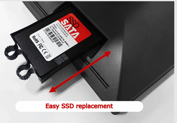
Easy SSD replacement