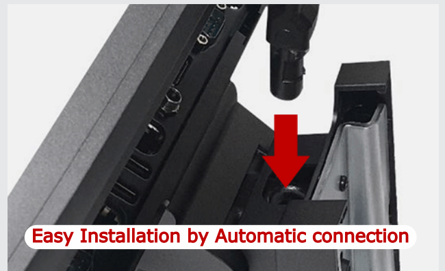
Easy Installation by Automatic connection