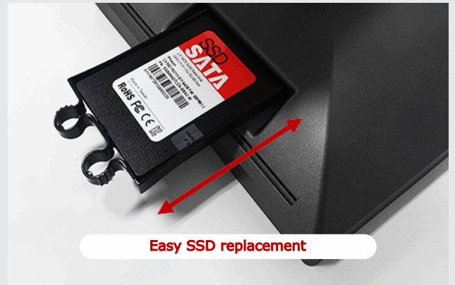
Easy SSD replacement