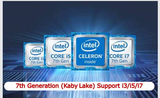
7th Generation (Kaby Lake) Support i3/i5/i7