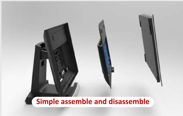
Simple assemble and disassemble